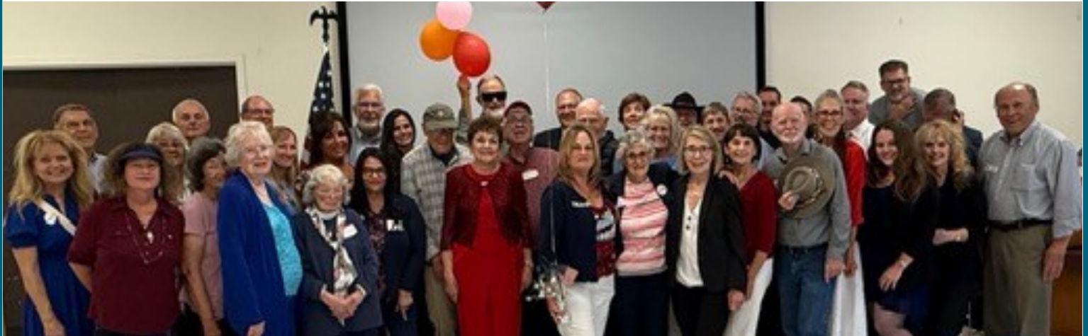
Some of the many attendees at the Constitution Day Conference, Becker Center, Santa Rosa